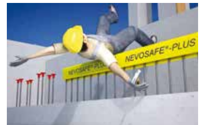
Above: NEVOSAFE™ safety strip